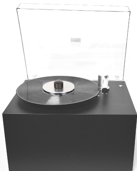
Optional dust cover for VC-S