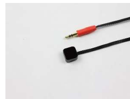
Wide Range IR Receiver