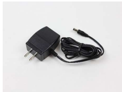
12v Power Supply