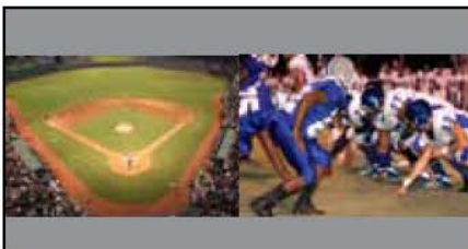
Layout Option 1: 50-50% split screen

Project two images (video or still) side-by-side from two different sources simultaneously. Choose from three layout options. You can swap the images as well as choose the source for audio.