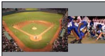
Layout Option 2: Main image on left