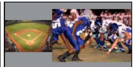
Layout Option 3: Main image on right