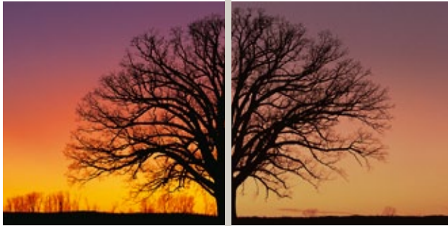
High Colour Saturation