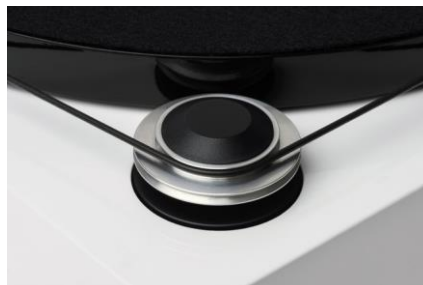
Diamond-cut aluminum drive pulley: precise power transmission