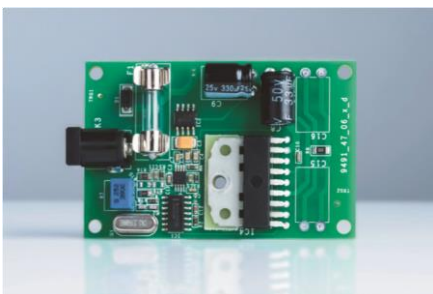
Built-in DC-powered motor control: better speed drift connection cable Connect-it E included