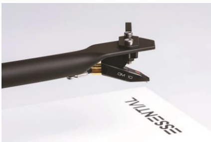
One piece 8.6" aluminum tonearm Cartridge: Ortofon OM10

OM10 by the phonographic cartridge pioneer Ortofon, Essential III Phono delivers lively, balanced and highly involving sound that will delight every vinyl lover.