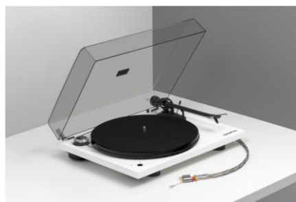
Dust cover, felt mat and high quality speed stability with minimized