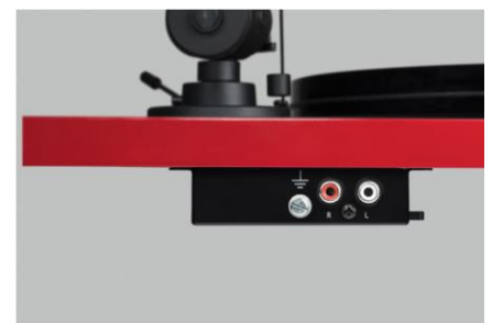
Switchable line or phono output speed stability with minimized