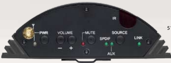
AFX-19PT102 - Top View